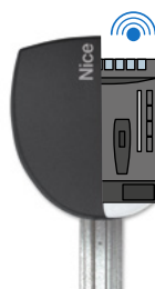
Nice Control Unit