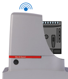
Nice Control Unit